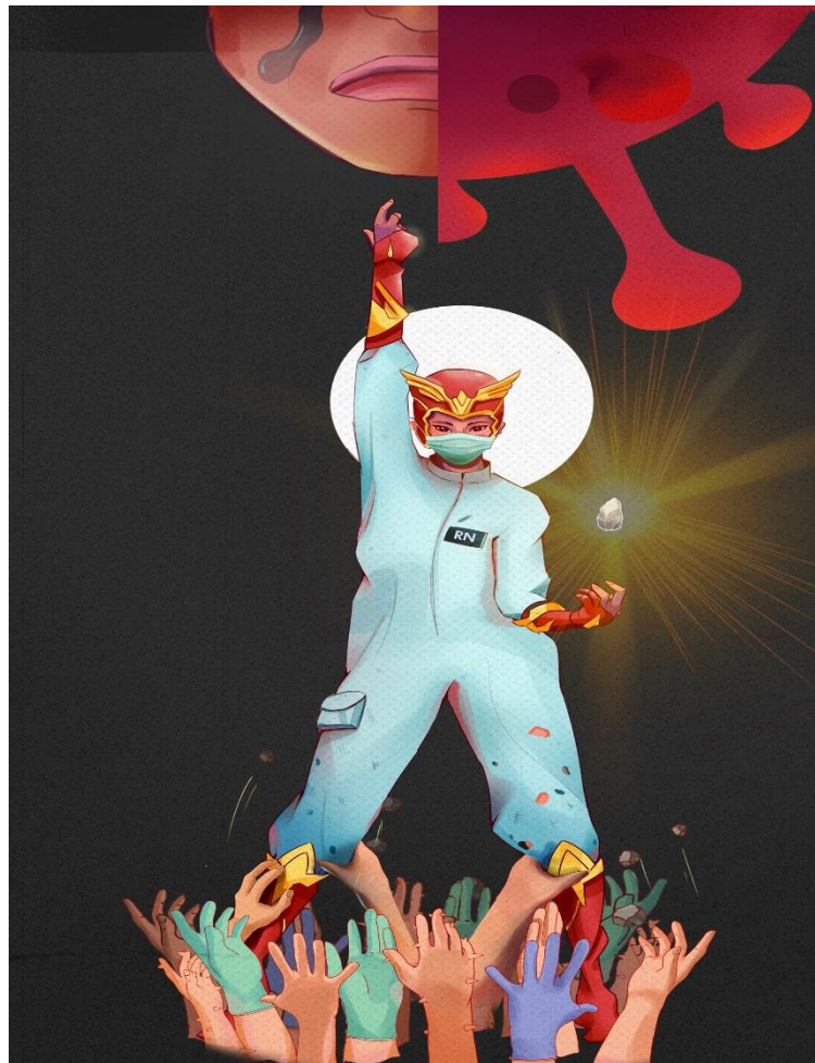
Fig. 3 Padayon: Beyond the Call of Duty amidst adversity

With the image above, five themes were generated and remodified from verbatim of the Filipino nurses. The researchers integrated the first theme: The model depicts the care context as weaponry and armor seen in the extremities, the metal headdress worn by the nurse, and the PPE itself. These objects represent the equipment used to protect patients and provide nursing care. Yet, due to the extensive and impenetrable gearing required to fight an inconspicuous infection, this PPE became a hindrance and barrier to nursing care delivery and communication between the nurse and the patient.